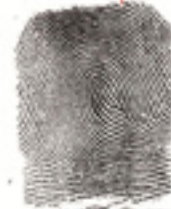
4. Right Ring