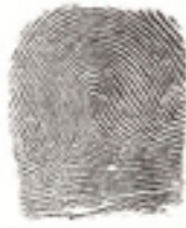
3. Right Middle