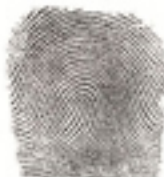
8. Left Middle