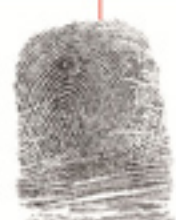
8. Left Middle