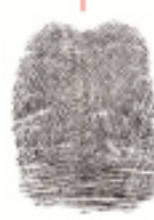
9. Left Ring