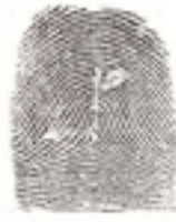
7. Left Forefinger