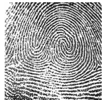
COMPOSITE: A mixture of two or more separate patterns