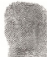
9. Left Ring