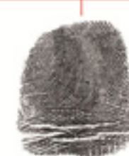
10. Left Little

PREPARED BY: CALGARY POLICE SERVICE IDENTIFICATION SECTION