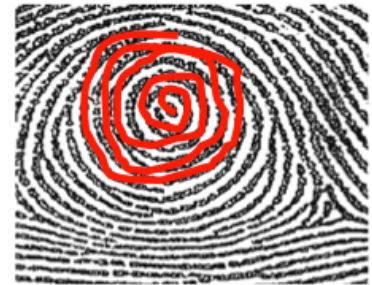
WHORL: Lines form a spiral – a bit like a whirlpool

- Whorls are found in 35% of the population