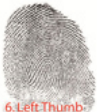
6. Left Thumb