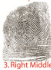
3. Right Middle